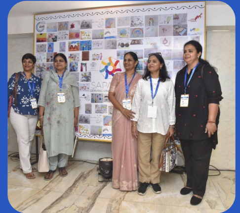
Participants gathering at the installation with contributions of art from children on their interpretation of service