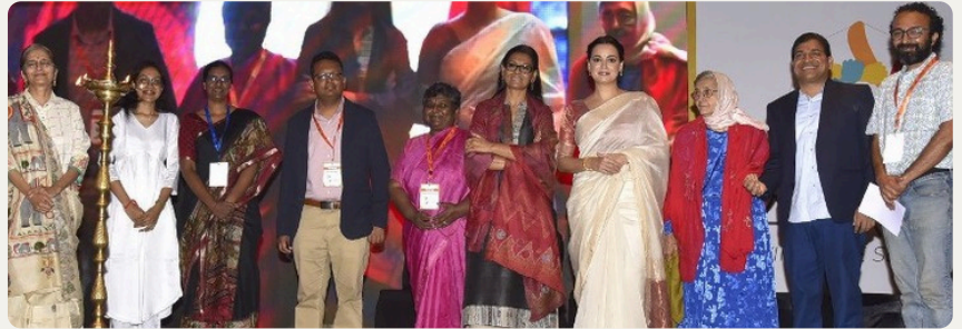
The Conference officially began with the lighting of lamp by guests and IMF Trustees

The inaugural address by Dia Mirza was an apt beginning to the two-day convention where she spoke heartily about love and learning. The keynote speech was given by Nandita Das where she drew from many experiences as a parent and from her own life as a child, stressing on creating an environment where children can question, leave fear out of the equation and exist without judgement.