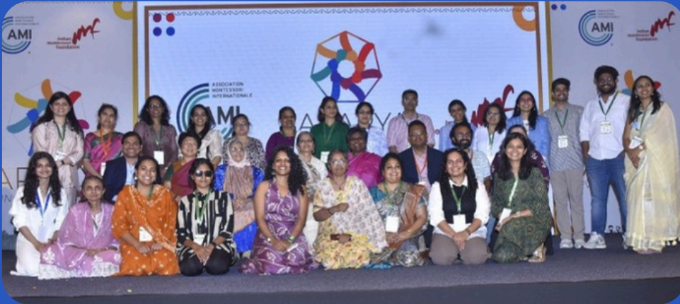
The IMF volunteers, who mostly comprise of Montessori teachers, behind the logistics and execution of the conference