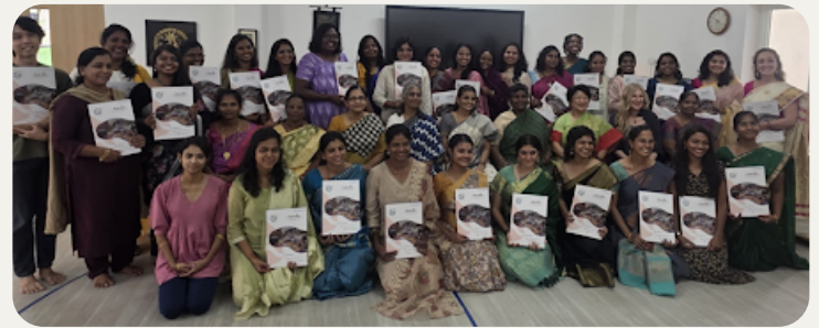
Students of the 21st Primary Batch and 2nd Summer Course at Supraja Montessori Study Centre, Chennai, had a nostalgic ceremony where there was sharing of experiences, poetry and compilation of videos from the course